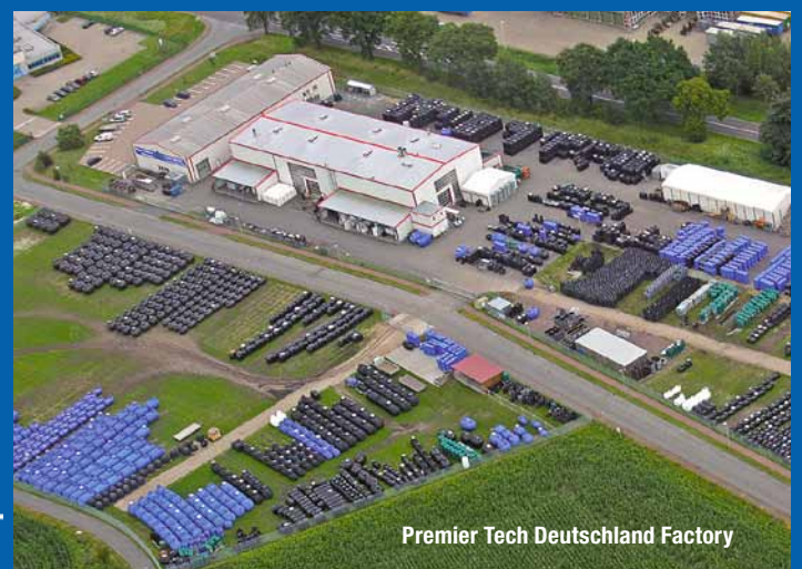
Premier Tech Deutschland Factory